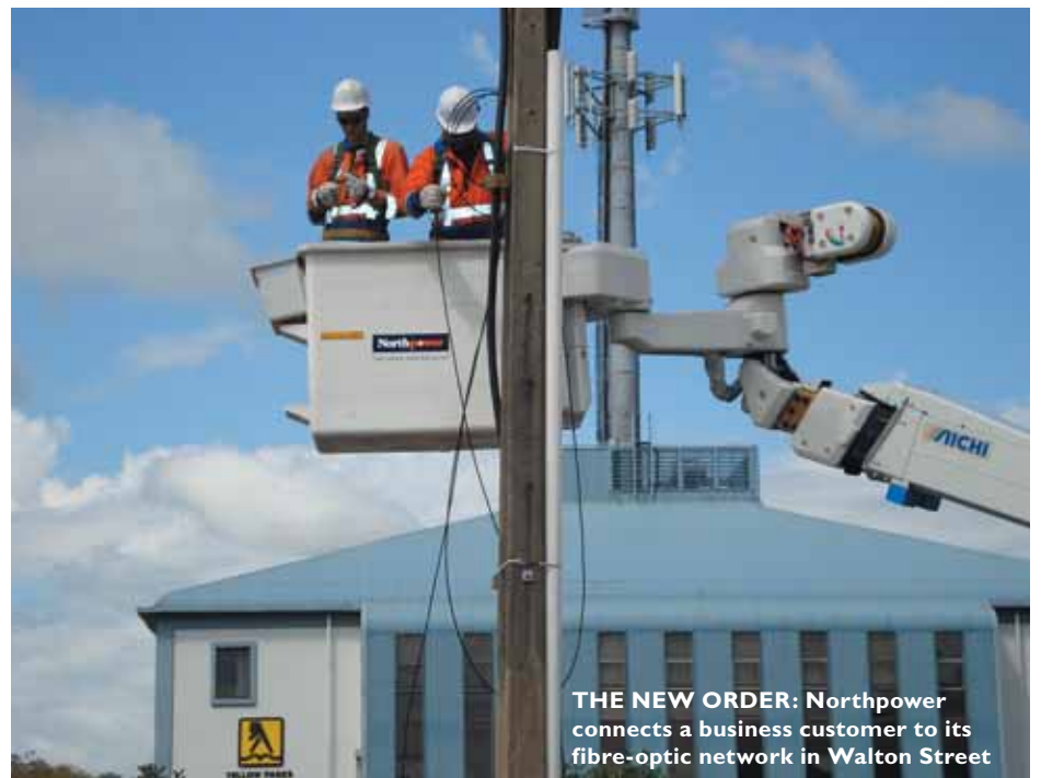
THE NEW ORDER: Northpower connects a business customer to its fibre-optic network in Walton Street

Until then, it must recover some of its initial investment by encouraging local businesses to connect to its existing fibre-optic